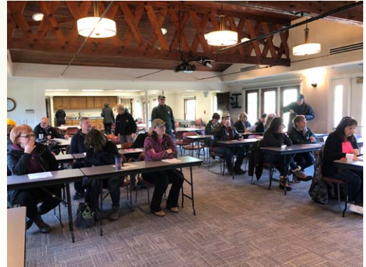
2019 Spring New Volunteer Orientation

The spring clean up days brought out the most dedicated volunteers with weather that was cool. I promise spring is coming! We did have a good turn out of interested new volunteers who attended the orientation and who then joined us in the garden work activities. Welcome to you all and I enjoyed spending the morning and a wonderful pancake brunch with you and invite you back soon and often. The maple syrup volunteers provided a wonderful pancake brunch and we are thankful for their successful efforts with record syrup production as well as their culinary skills utilizing their Tollgate syrup.