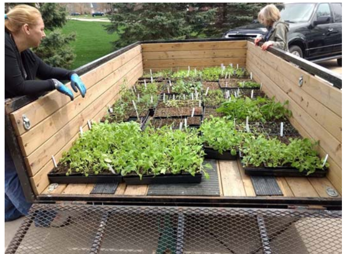
Seedlings Harden Off in the Bed of Large Snowmobile Trailer