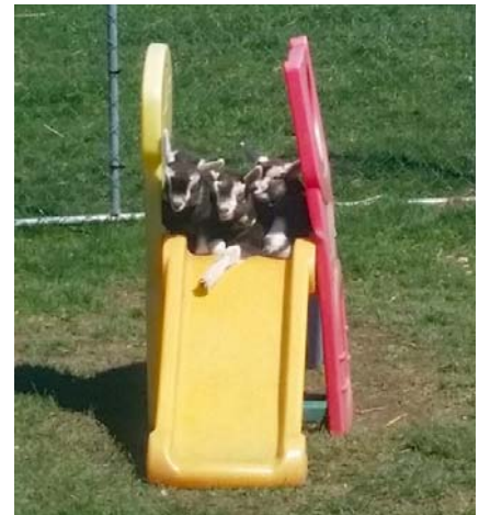
Those Crazy Cute Kids