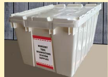
Nursery Tool Shed

The cleaning regimen may extend to other garden areas to prevent the spread of new garden viruses.