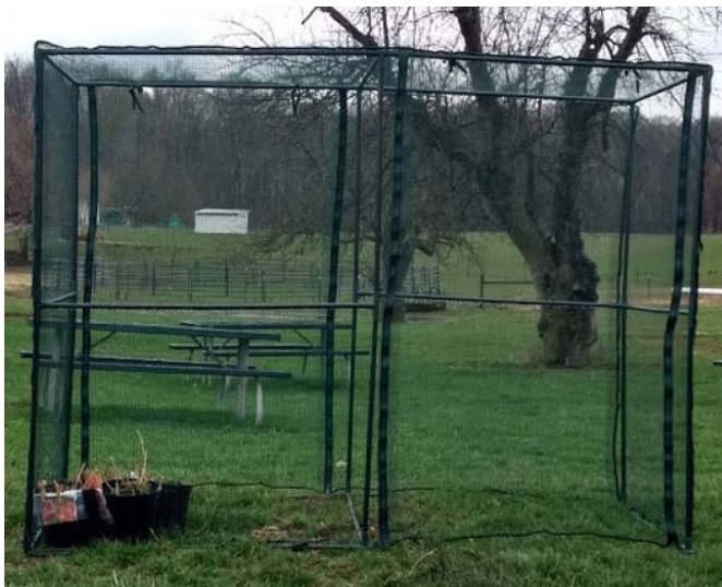
New Pop-Up to Receive Plant Donations

Plants may be dropped off anytime the Tollgate gates are open! You don't need to wait for a Saturday workday or when a nursery team member is available! Directions are posted near the pop-up and attached to the PLANTS WANTED emails that are sent out.