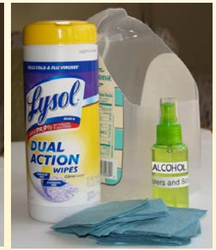
Disinfecting Kit Contains Alcohol, Blue Shop Towel Swatches and Lysol® Disinfecting Cloths