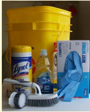
Buckets, Dawn® Detergent, Brushes, Lysol® Disinfecting Cloths and Disposable Gloves are also Available at the Tool Disinfecting Station