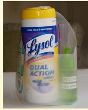
Portable Disinfecting Kit for Pruners Scissors, Trowels, Hand Weeding Tools or Hedge Trimmers